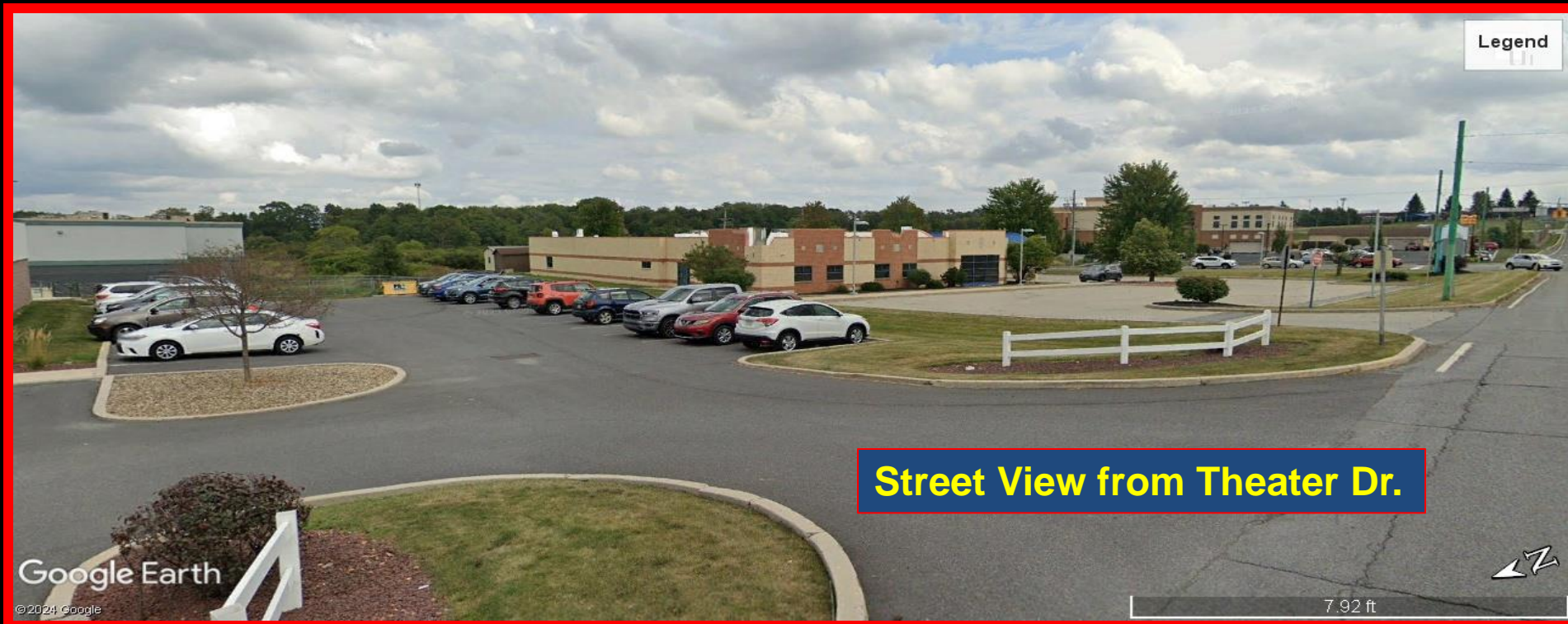
Street View from Theater Dr.