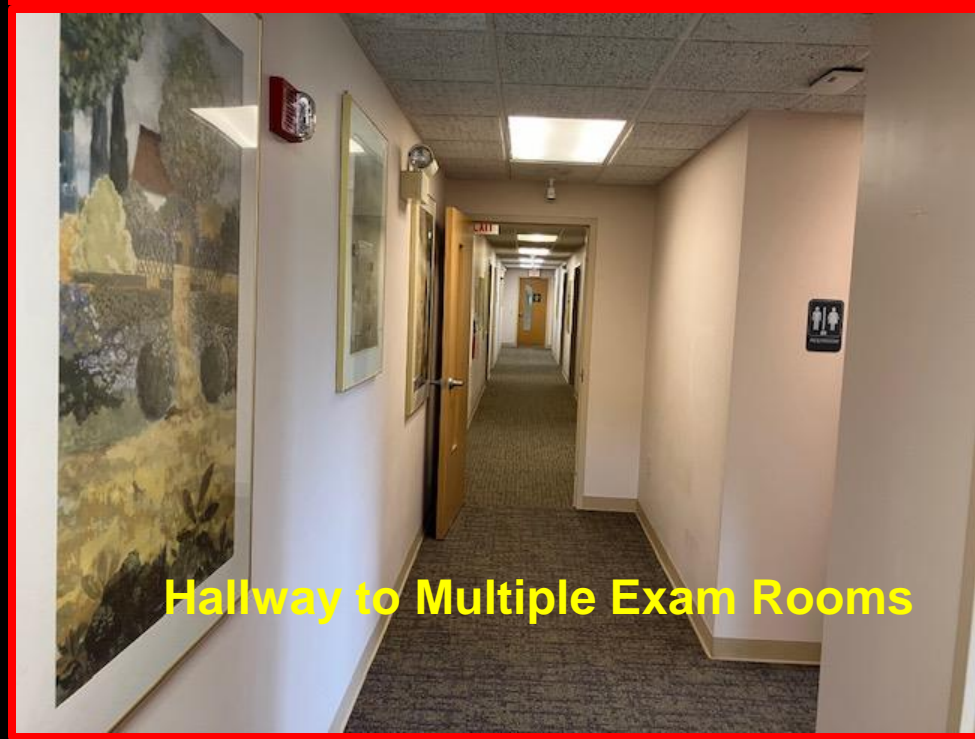
Hallway to Multiple Exam Rooms