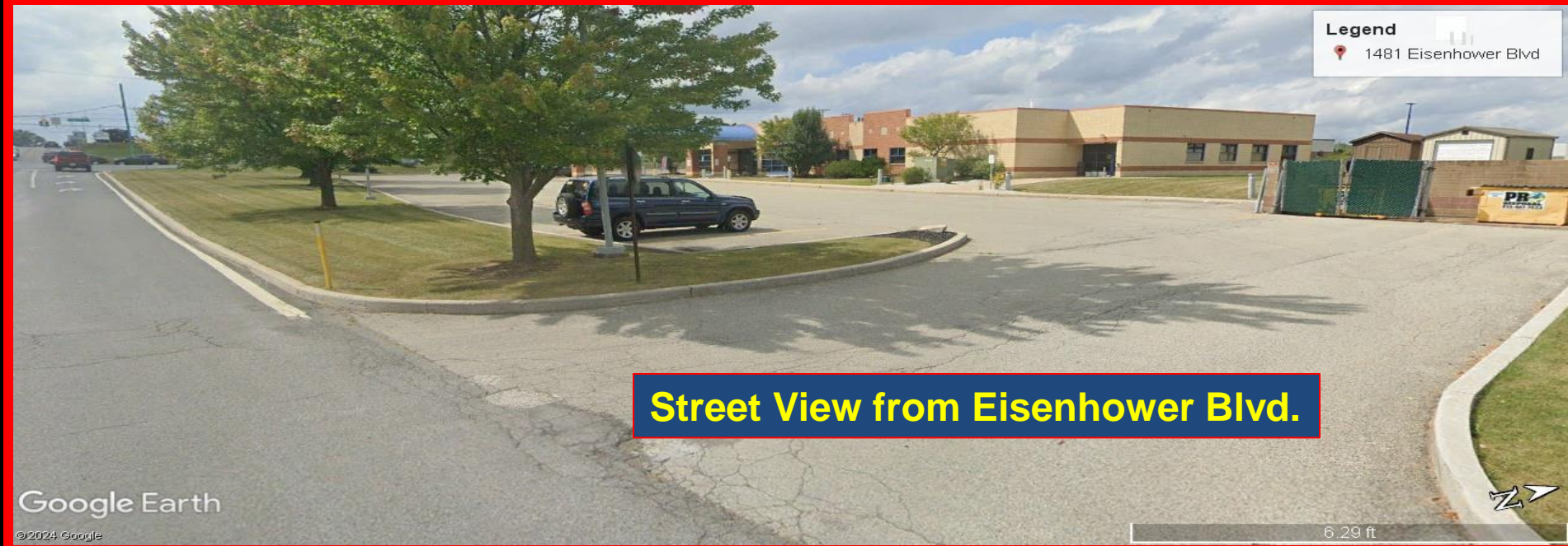
Street View from Eisenhower Blvd.