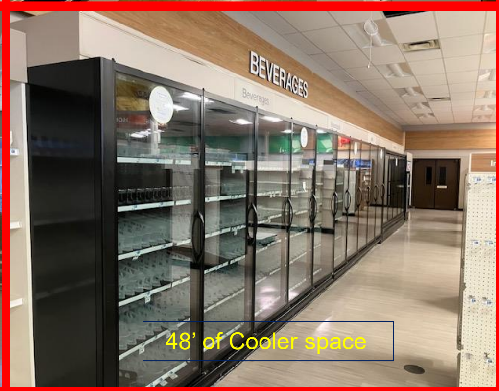
48' of Cooler space