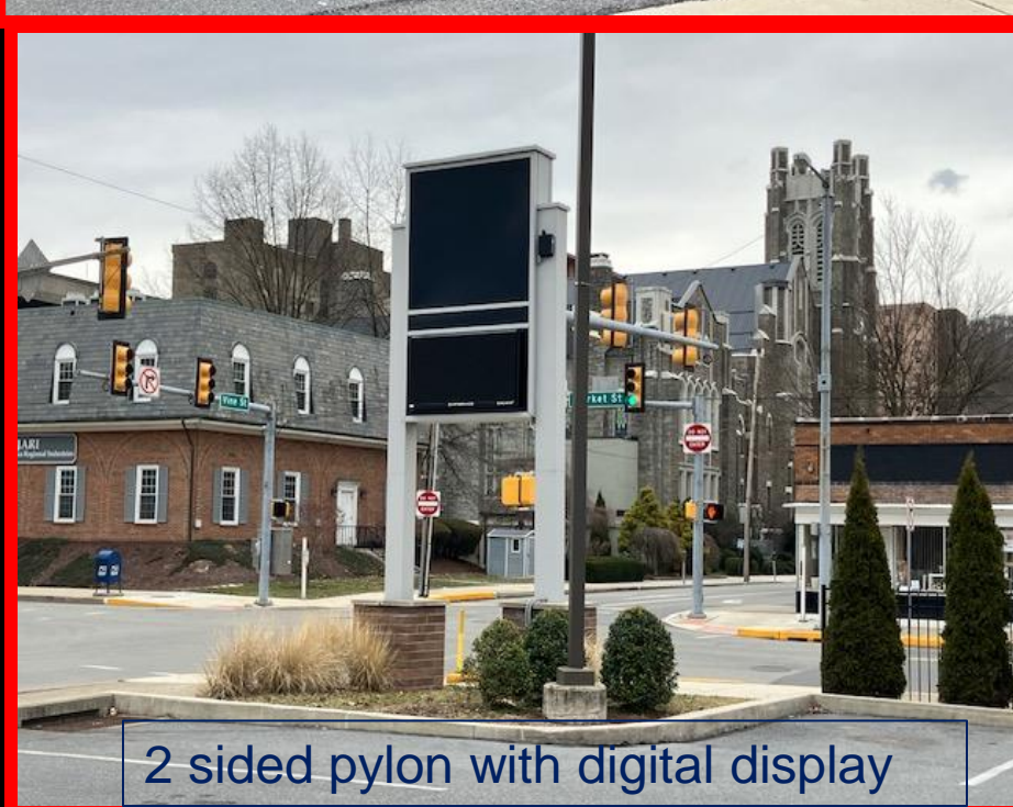
2 sided pylon with digital display