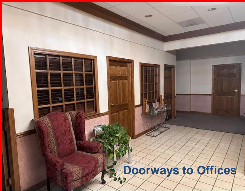
Doorways to Offices